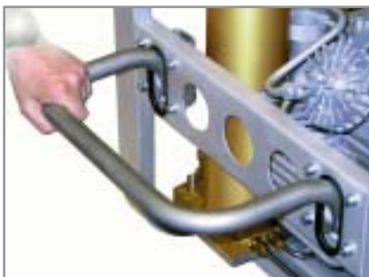
ergonomic swing-out handles