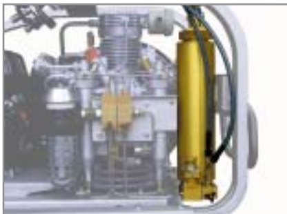
Super-TRIPLEX P 31