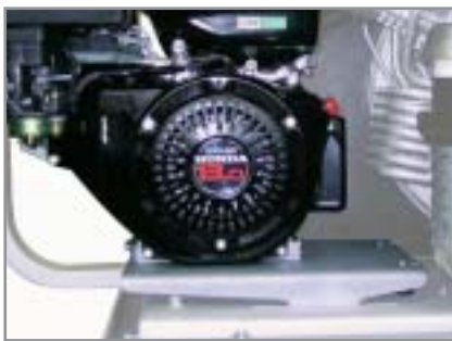
vibration reducing motor rocker